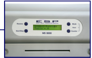
Easy Read LCD display