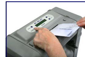
Single sealing option