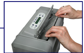
Easy Access for cleaning